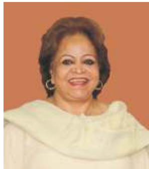
Mrs. Salma Ansari Renowned Social Worker and Wife of Hon'ble Vice President of India