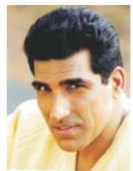
Mr. Mukesh Rishi Noted Film Actor