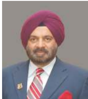
General J.J. Singh Chief of the Army Staff (Retd.) & Governor of Arunachal Pradesh