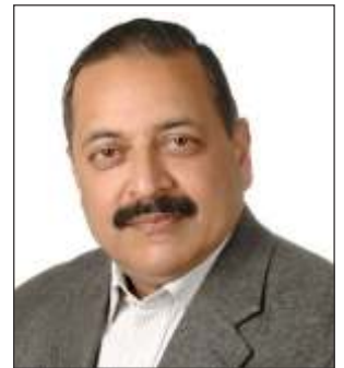
Dr. Jatinder Singh Minister of State (Independent Charge), GOI, Noted Diabetician & Writer