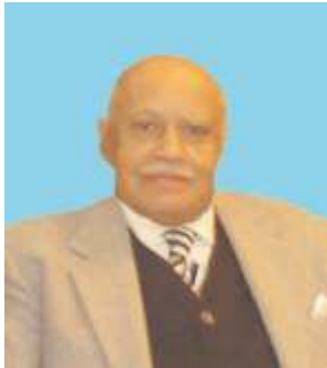
Dr. A.S. Anand Former Chief Justice of India & Ex-Chairman National Human Rights Commission