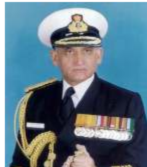
Admiral Arun Prakash Chief of the Naval Staff (Retd.)